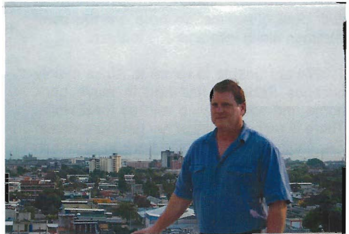
Overlooking the city from the roof of our RTM-V studio