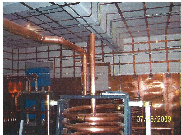
This is similar to what part of the room will look like when complete