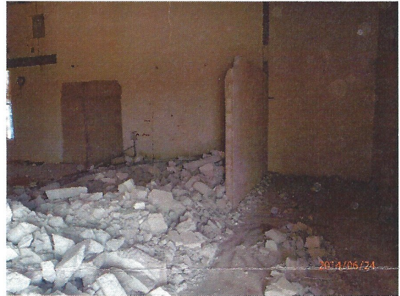
Old transmitter hall demolition